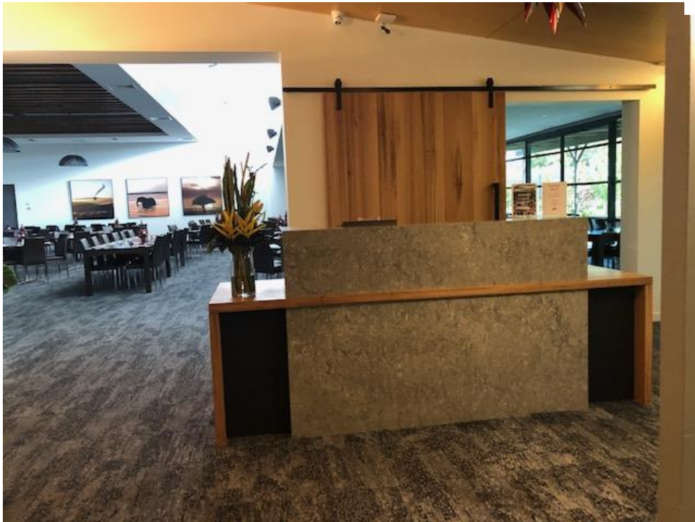
BISTRO RECEPTION & NEW BAR Our friendly staff will ensure your visit is a pleasant one.